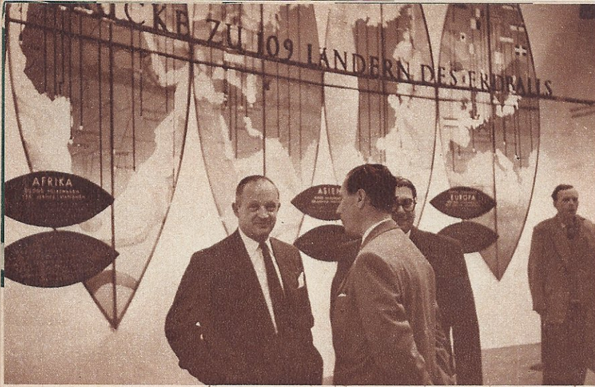
The 37th Frankfurt show, a biennial affair, was notable as much for sumptuous settings as for new cars. Volkswagen boss Nordhoff (at left, facing camera) stands before a stylized map of the world—more and more, these days, his world.