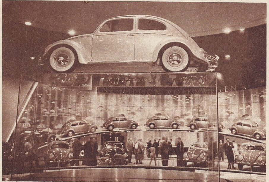
On a tall glass pedestal stands the millionth Volkswagen, while beyond, the "people" gape at their "car" exhibited in profusion on a kind of vehicular Rainbow Bridge to a rear-engined Valhalla—presumably somewhere near Wolfsburg.